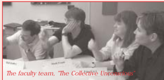
The faculty team, "The Collective Unconscious"