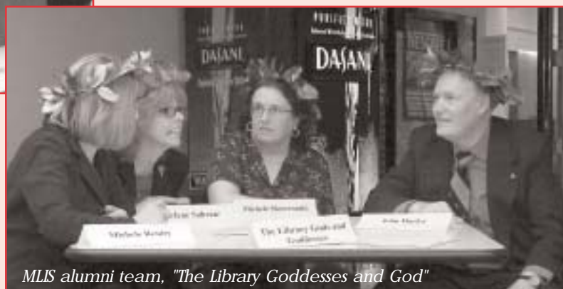
MLIS alumni team, "The Library Goddesses and God"