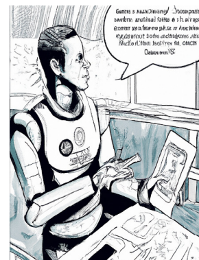
Image generated with DALL-E prompt "a comic book drawing of [subject] dressed in a futuristic costume and teaching AI"

Director of Intelligent Conversational Agents & Neural Networks Lab