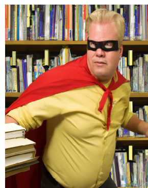
Image generated with DALL-E prompt "superhero version of male blond librarian defending books"

Director of School Library System for Genesee Valley Educational Partnership